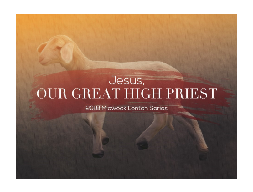
Starting February 14th